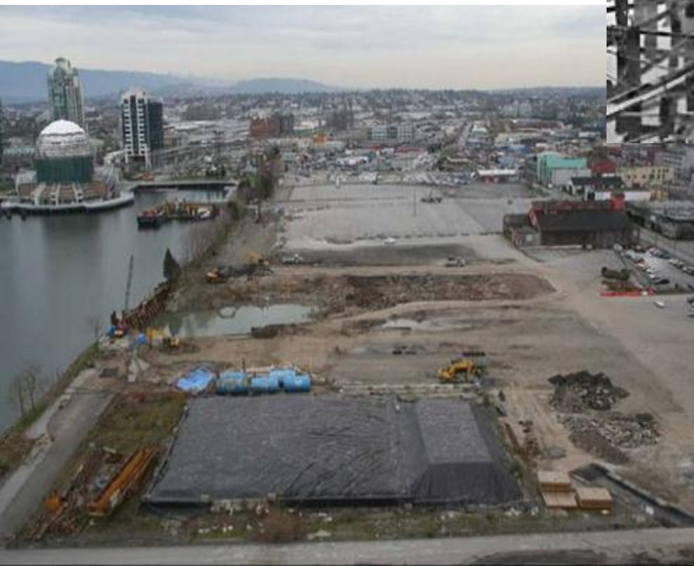
Pre-construction circa 2003